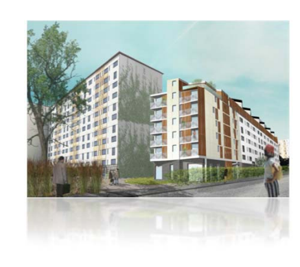
Logirep: Vitry, Paris region