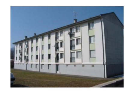
Dynacité: Nurieux, Lyon region